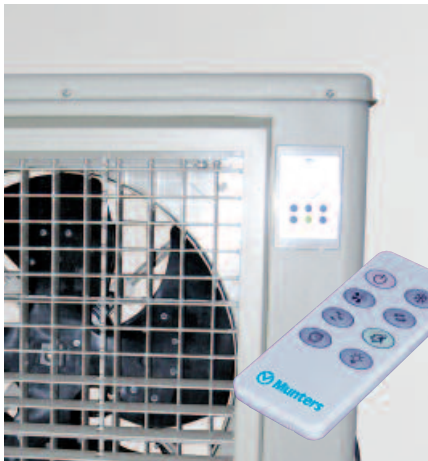
FCA 5F comes with a display and a remote control to easily operate the unit.