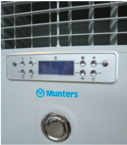
Display close up with different running features.

CCX is a product of Munters Keruilai Air Treatment Equipment (Guangdong) Co., Ltd.